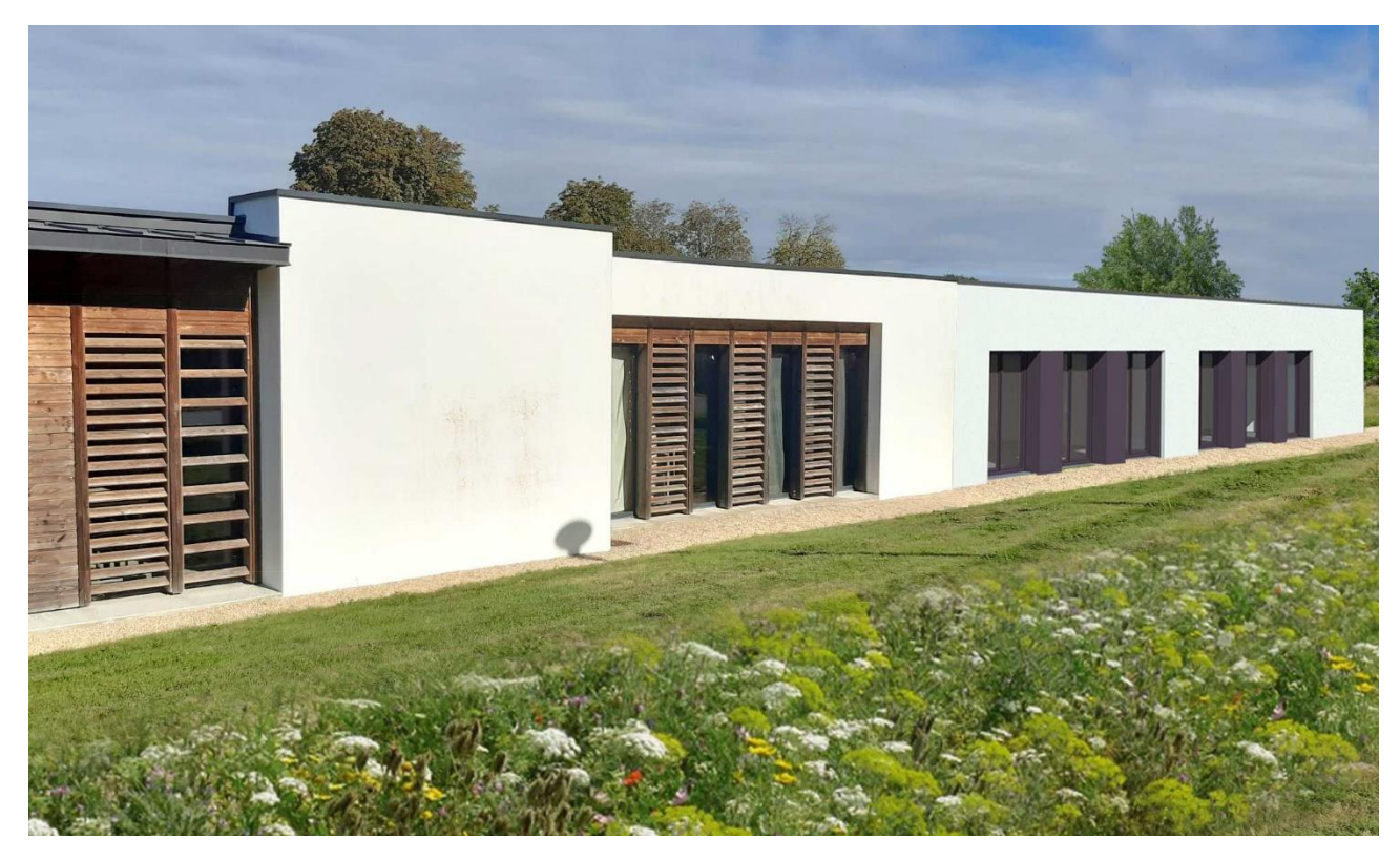
The IFACOM training center in La Ferrière (Vendée, western France)

This partnership combines both a high environmental and technical performance construction process and the use of innovative low-carbon materials. This is the first step in the partnership initiated with the Cougnaud Group, which consumes a surface area of approximately 20,000 m<sup>2</sup> of concrete slabs every year.